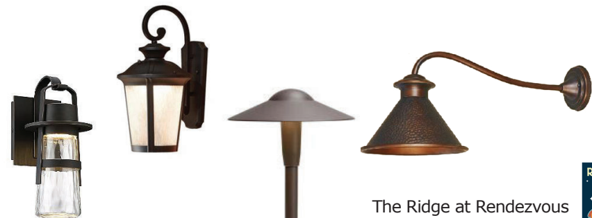
The Ridge at Rendezvous

Site lighting must be confined to areas enclosed by walls or be in the vicinity of the main entrance, with the exception of safe passage lighting on walkways from the street to the front door.